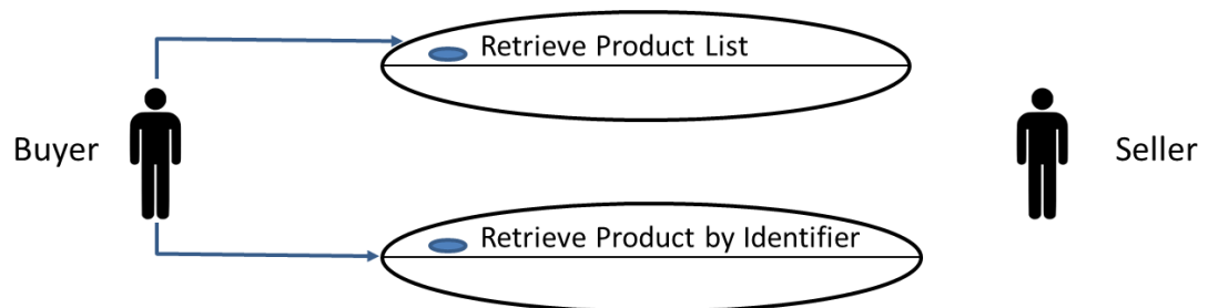
Figure 1 - Product Inventory Retrieval Use Cases

This section defines the Use Cases that support the retrieval of Product Inventory by a Buyer from a Seller's Inventory Management System.