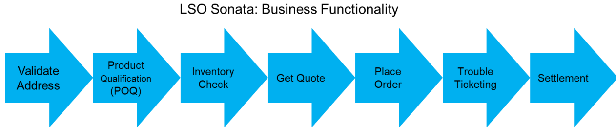
Figure 2: LSO Sonata Business Functionality

These are all examples of ICT-SP-Wholesale Partner business activities that rely on business functionalities in both parties. Examples of a wholesale partner business functionality include ‘provide serviceability response for specific location’, ‘receive request for quote’, ‘report duration of service use’, ‘send invoice for service’ etc.